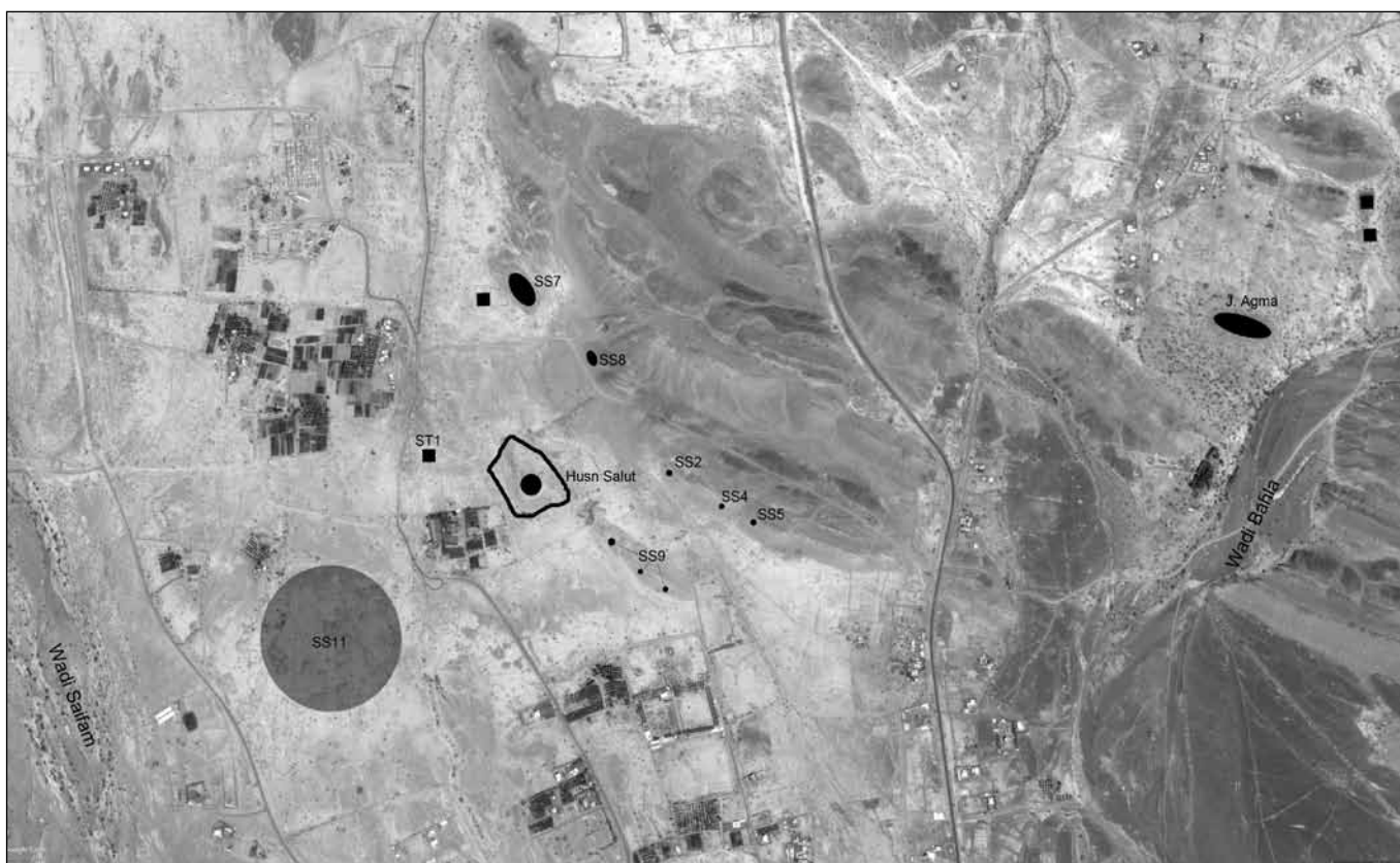
FIGURE 3 – Bronze Age and Iron Age occupation patterns in the Salut plain and adjacent wadi Bahla plain. Squares indicate Bronze Age remains, rounded shapes Iron Age sites (the larger, the more conspicuous; the line around Husn Salut shows possible extension of the associated settlement, i.e. Qaryat Salut). Site names follow IMTO survey coding (see CONDOLUCI, DEGLI ESPOSTI AND PHILLIPS 2014; also PHILLIPS, CONDOLUCI AND DEGLI ESPOSTI AND 2011). SS11 comprise an area of field-leveelling mounds (Ara-bic nadud), rich in Iron Age pottery.

From a complementary perspective of the excavation, it thus became of great importance, after the first seasons of field work, to locate the settlement or settlements that likely gravitated around such a prominent site as Husn Salut. In 2009, a new program of surveys became included in the ever enlarging IMTO's scope, finally attaining success as a series of smaller but anyhow not negligible areas of Iron Age settlement were located (fig. 3). While the results of these surveys were detailed elsewhere, 29 worth underlining here is the fact that all these 'satellite' sites were placed along the lower slopes of other hills and rocky outcrops, thus suggesting that the more easily irrigable plain was saved for agricultural exploitation.