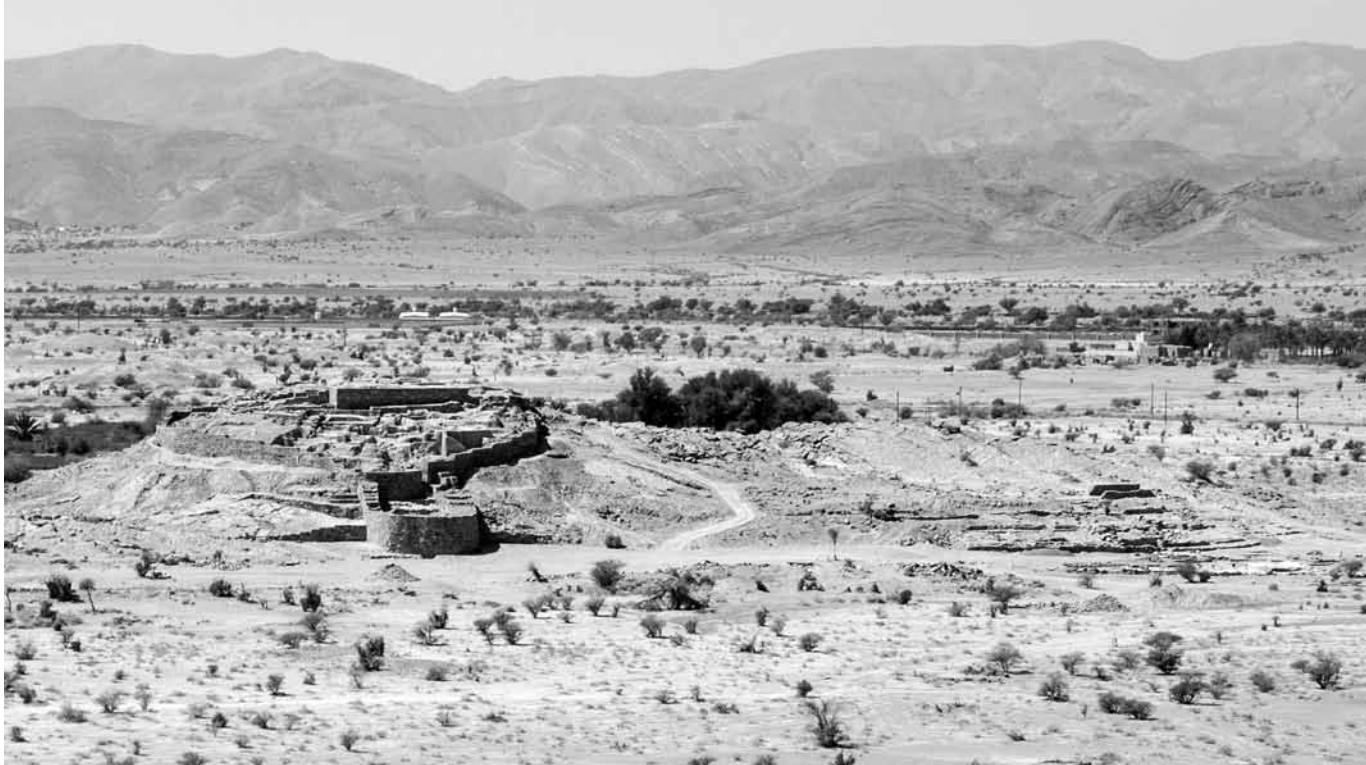
FIGURE 4 – A general view of the new IMTO’s excavation at Qaryat Salut (April 2017).

endary Azd migration to Oman to the 4 th century BC at the latest, much earlier than usually hypothesized. 40 Second, such a date would find a rough correspondence in the chronological range of some ceramic affinities evident at Husn Salut, and in the presence of South Arabian items, thus contributing to the discussion on the final date of Iron Age Salut (see Chapter 10).