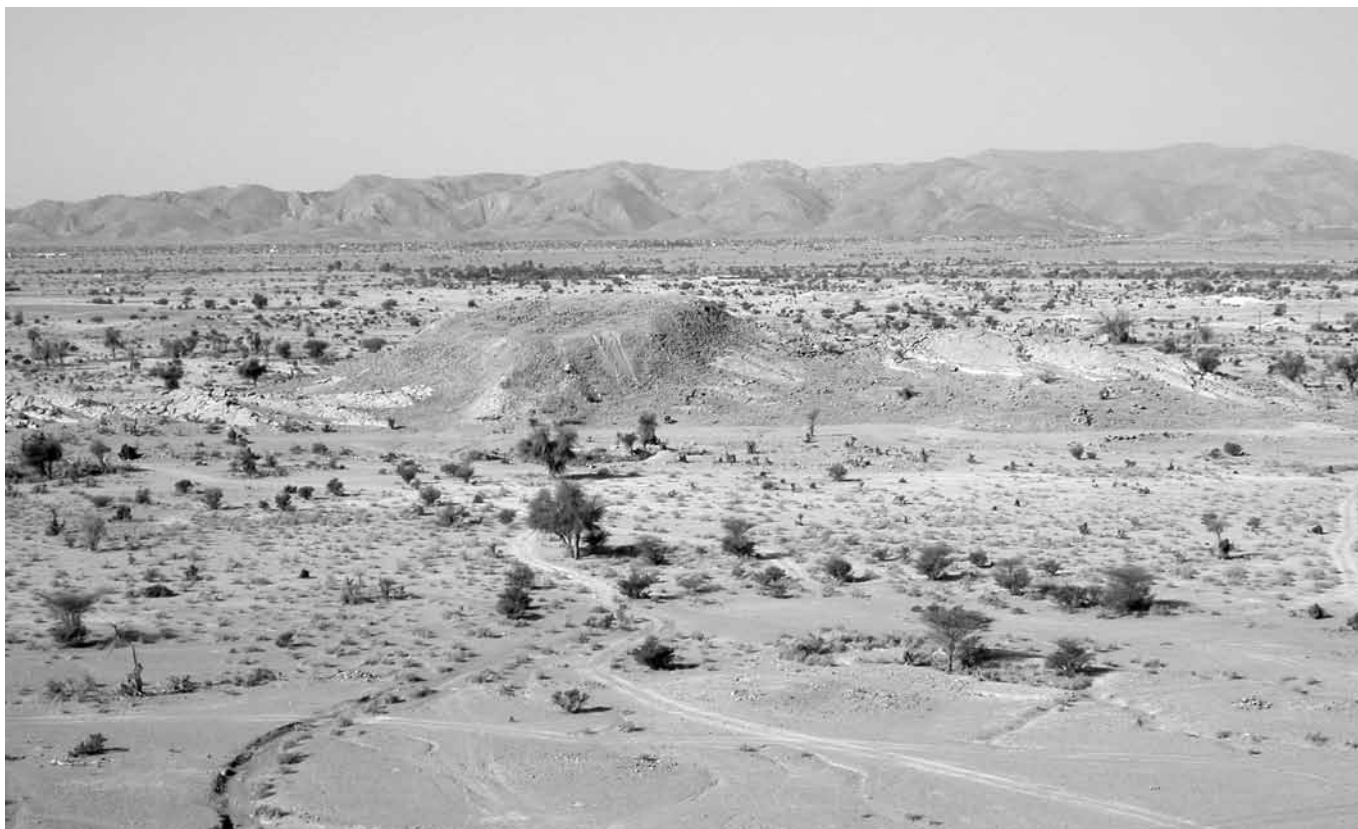
FIGURE 2 – General view of Husn Salut in 2004, at the beginning of IMTO's work.

Saifam, east of its course and near the point where it joins the larger Wadi Bahla, roughly 2.5 km to the northeast of the city centre of Bisya. The closest main centre is Bahla, some 30 km to the north, while the small village of ad-Dhabi stands two kilometres from the site as the crow flies, along the Wadi Bahla's course.